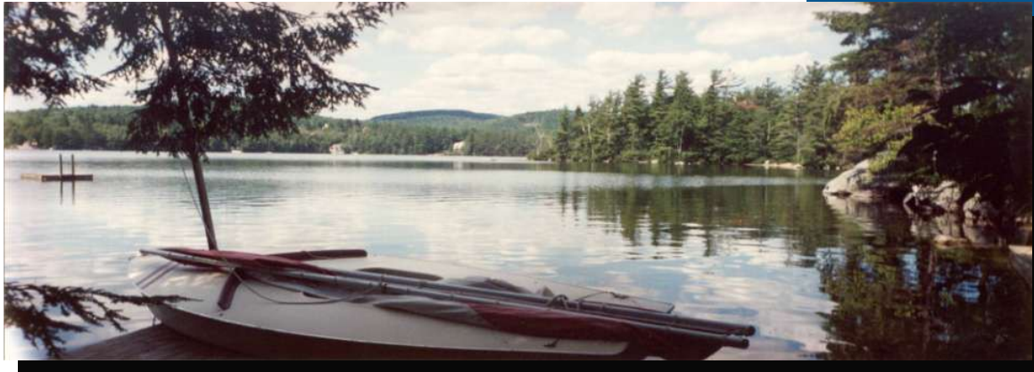
Denny Beach—Little Sunapee, NH